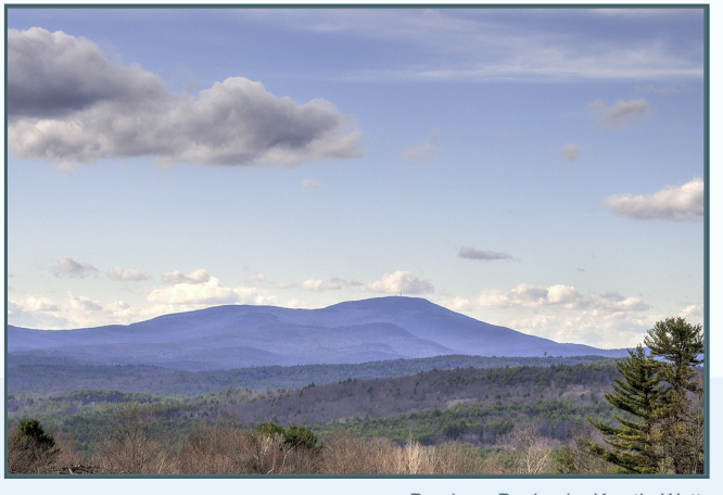
Brochure Design by Krystin Watts

Chamber of Commerce Danbury Wilmot Andover New London Sunapee Salisbury Hopkinton (202) (9) New London Mt Kearsarge 2023 Manchester